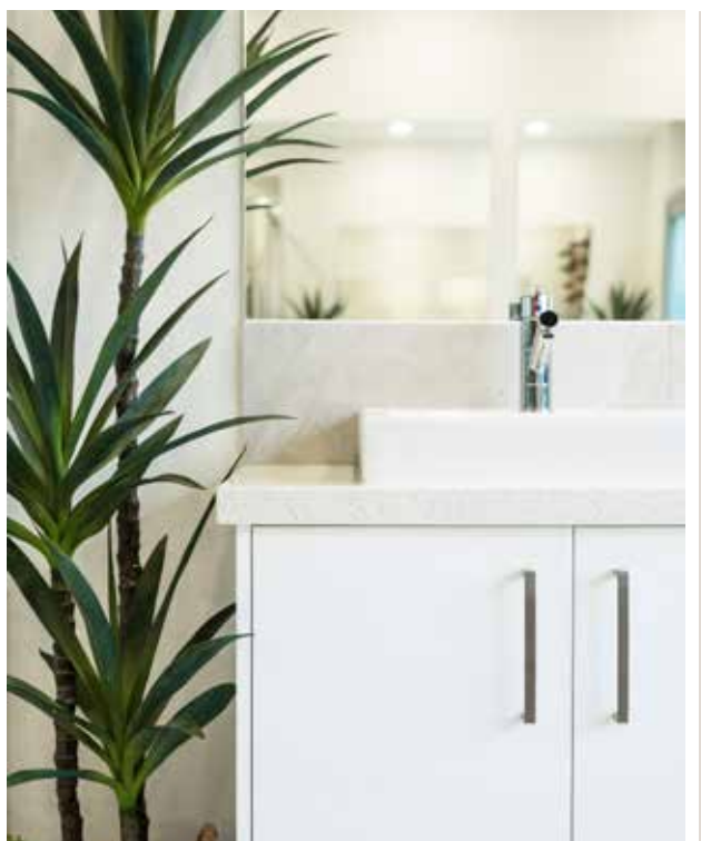
Standard Premium Mixer